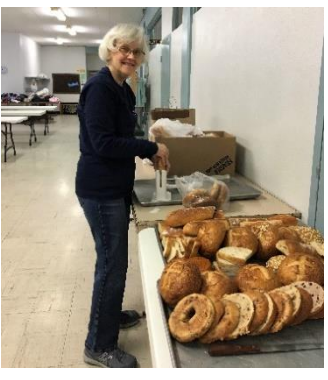
Whoever is kind to the poor lends to the Lord, and he will reward them for what they have done. Proverbs 19:17