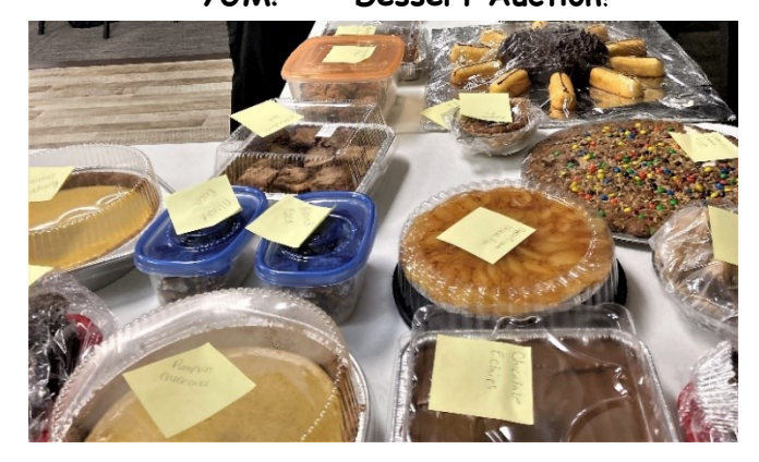
YUM! - Dessert Auction!

Chili Cookoff & Dessert Auction - Be on the lookout to sign up for the Chili Cookoff and Dessert Auction. The event will be on January 20th at 5:30pm. Get those chili and dessert recipes out and ready for a goodhearted competition. If Chili cooking is not your thing, just come join us for an evening of fun and good eating!